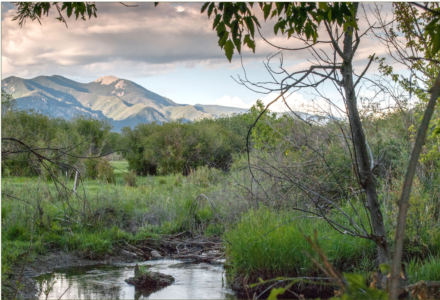
Rio Fernando de Taos