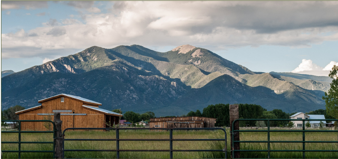
Droke Easement. Taos, New Mexico.