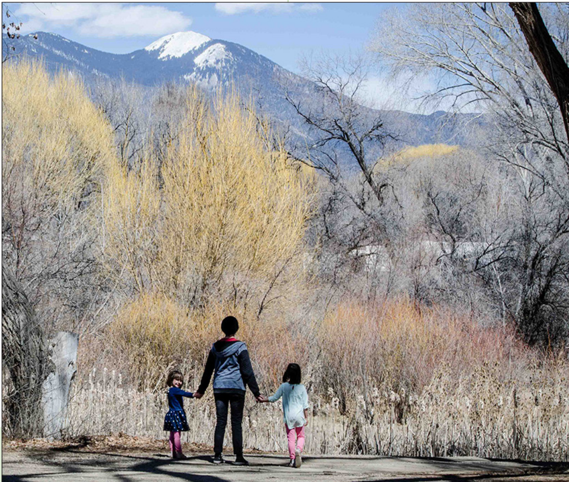
Above: Rio Fernando Park. Taos, New Mexico.