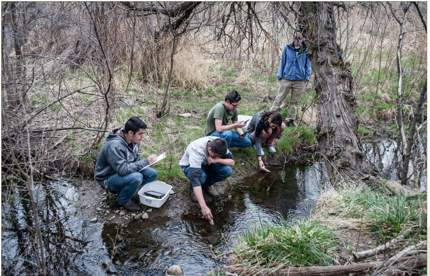
Taos High School Students Monitor Water Quality at a Conservation Easement along the Rio Fernando de Taos.

We are available for questions and concerns via email, phone, or scheduled visits during our regular business hours. 575.751.3138 or info@taoslandtrust.org